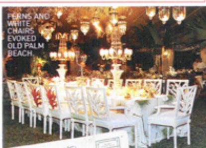
FERNS AND WHITE CHAIRS EVOKED OLD PALM BEACH.