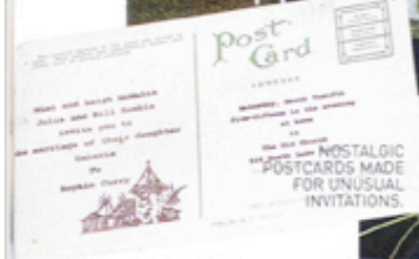
NOSTALGIC POSTCARDS MADE FOR UNUSUAL INVITATIONS.