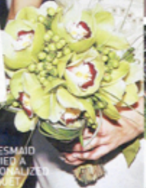
EACH BRIDESMAID CARRIED A PERSONALIZED BOUQUET.