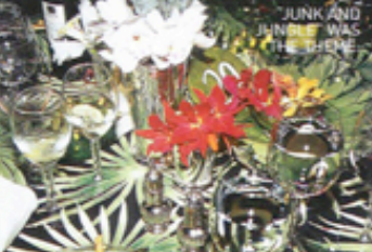
JUNK AND JUNGLE WAS THE THEME.