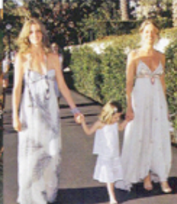
THE BRIDESMAIDS WORE PASTELS.