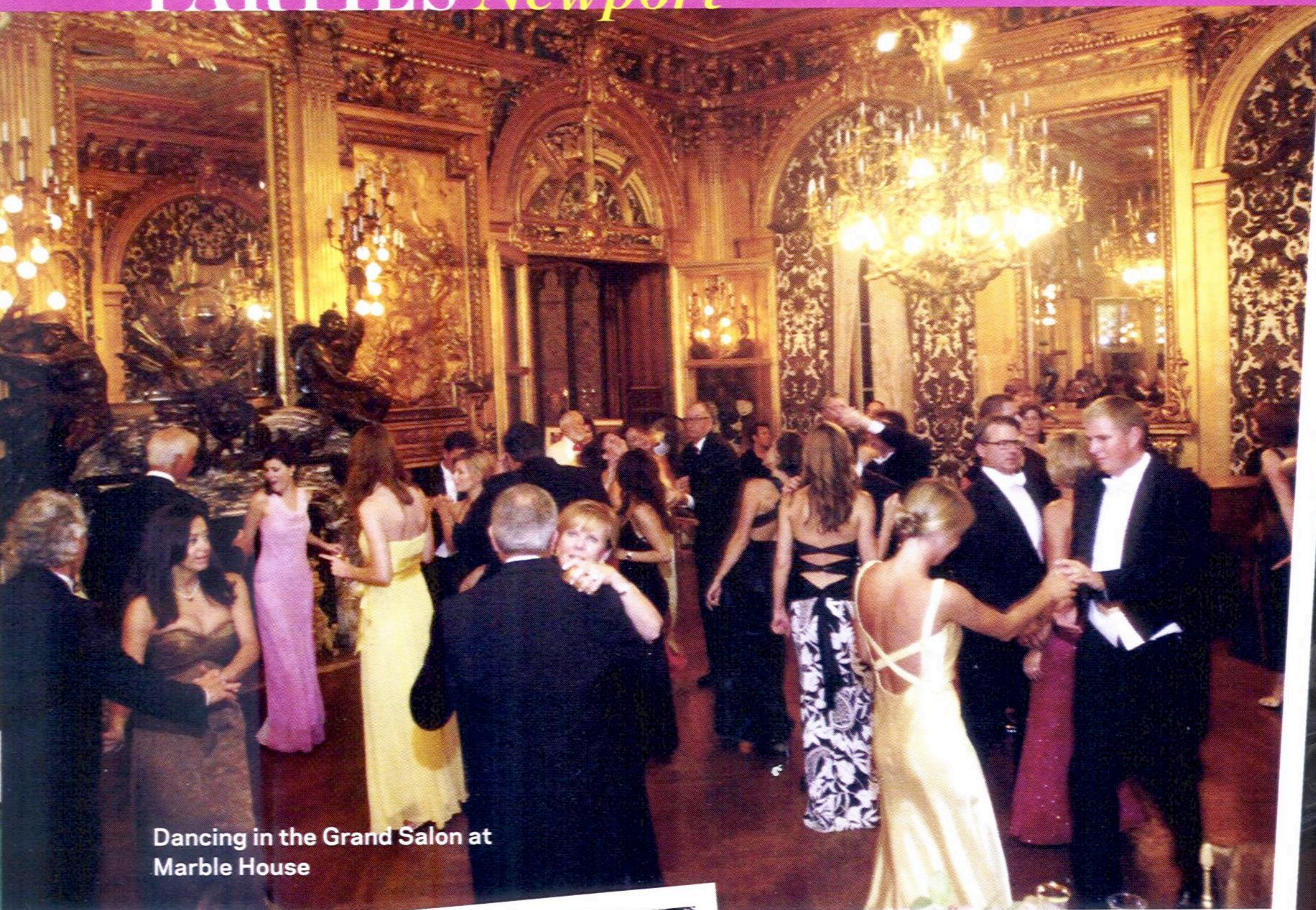
Dancing in the Grand Salon at Marble House